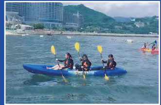
Beach and Water Activities