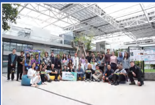
Floating Salon – Meeting with collaborators and supervisors