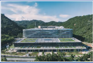
Tour of BGI Center