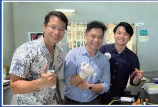
Experimental Techniques Intro