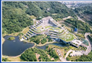
Tour of CNGB